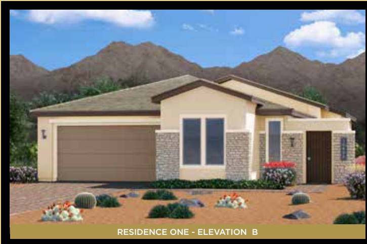
RESIDENCE ONE - ELEVATION B