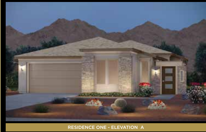
RESIDENCE ONE - ELEVATION A